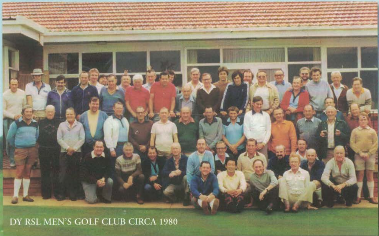
DY RSL MEN'S GOLF CLUB CIRCA 1980