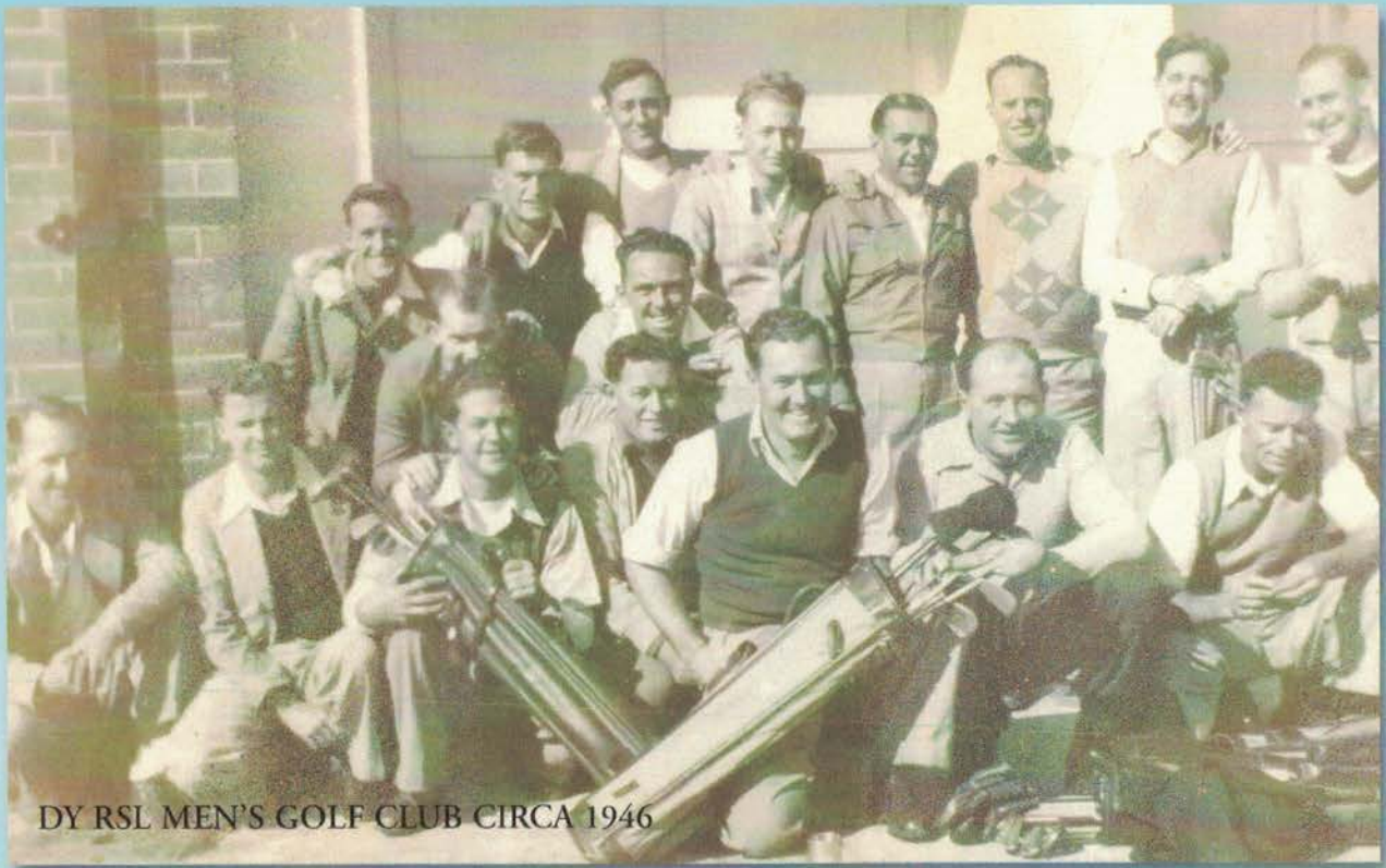
DY RSL MEN'S GOLF CLUB CIRCA 1946